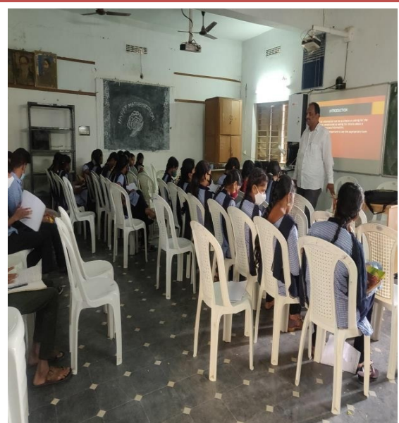
Lecture on listening skills